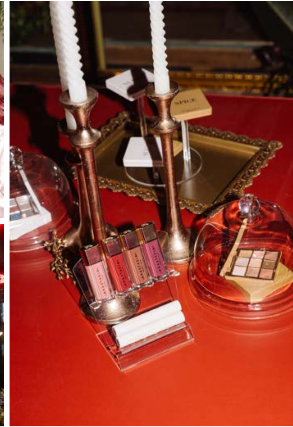
SUGAR AND SPICE GLOBAL PR EVENT CAPACITY: 200 PAX